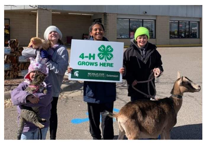
4-H Club members and volunteers offered a petting zoo and activities to the public at a local Tractor Supply Company store.